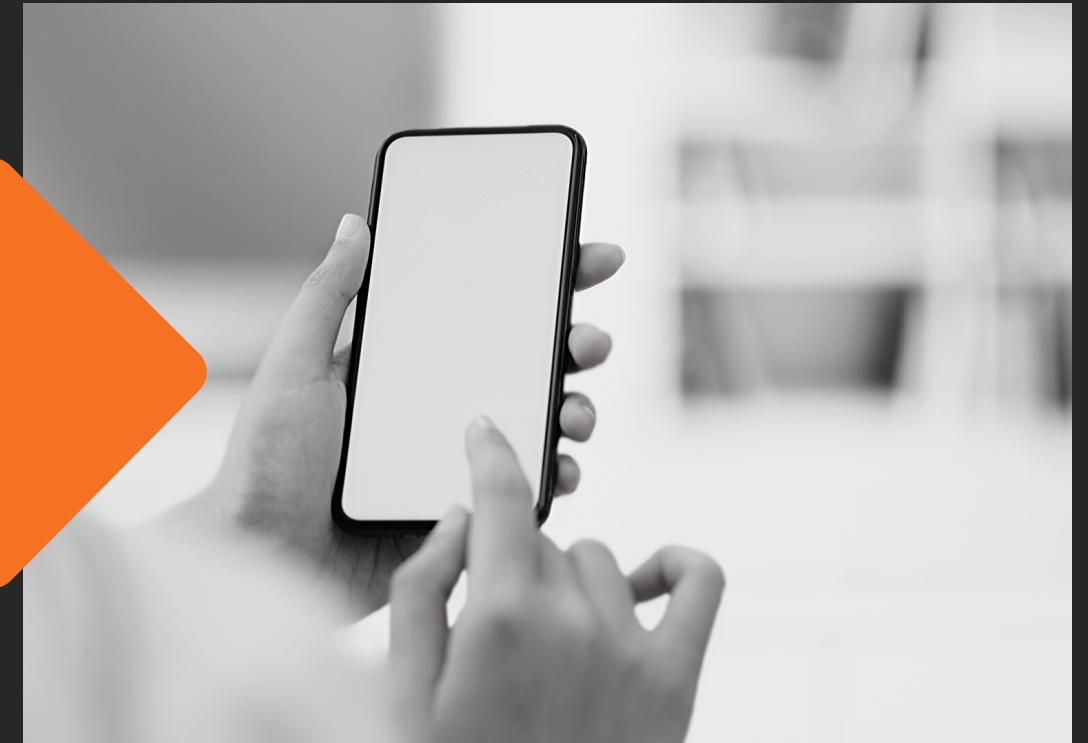
FOLLOW UP TEXT

Cast CLEAR Vision + BOLDLY ask each person to take their next step in their generosity to move forward the vision God has given your church.