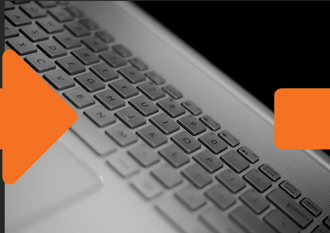
EMAIL TO LIST 2