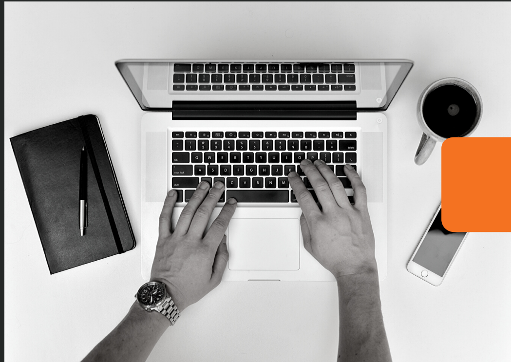
EMAIL TO LIST 1